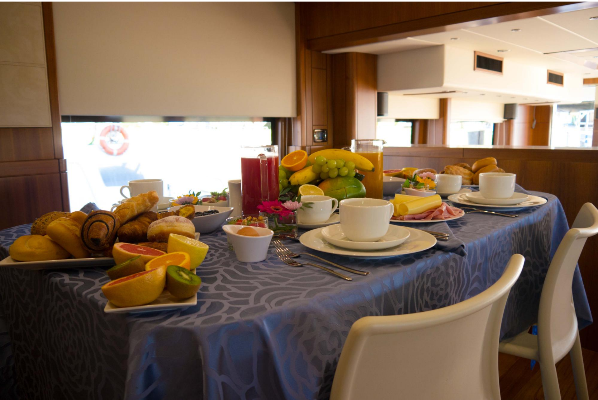
Table set for breakfast